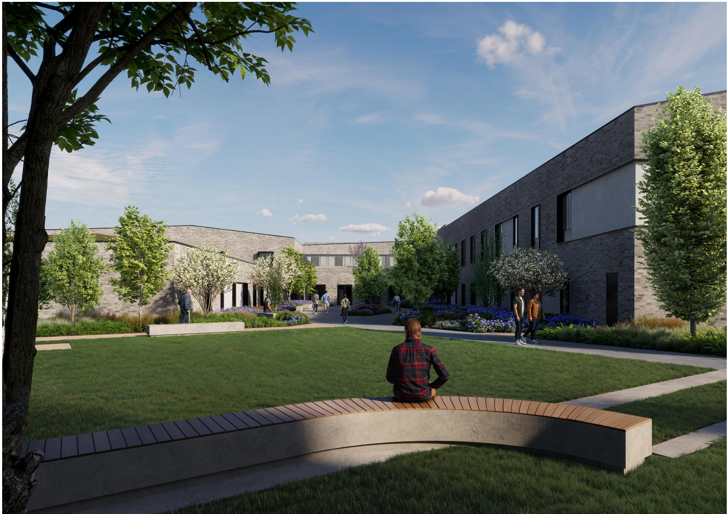
200-bed Adult In-Patient Hospital In-Patient Garden

COPYRIGHT: The design and details shown on this drawing are applicable to The Named Project only and may not be; reproduced, modified or relayed in whole or part or be used for any other project or purpose without the prior written permission of TOT Architects with whom copyright resides. DO NOT SCALE this drawing. Use figured dimensions only. The Contractor is responsible for checking all levels and dimensions on site prior to commencement of works. Any discrepancies are to be referred to the ARCHITECT. Drawings to be read in conjunction with all other Consultants Drawings & Specifications were relevant. Proprietary items shall be fixed in strict accordance with the Manufacturer's Instructions. Sizes of proprietary items shall be checked with Manufacturer.